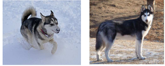
Figure 1: Two distinct classes from the 1000 classes of the ILSVRC 2014 classification challenge. Domain knowledge is required to distinguish between these classes.

The most straightforward way of improving the performance of deep neural networks is by increasing their size. This includes both increasing the depth – the number of net-